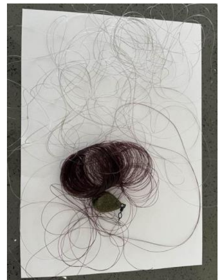
An unwanted item